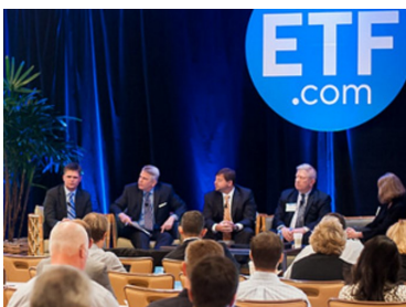
ETF.com conference, Newport Beach, CA