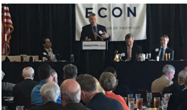
Economic Club of Nashville

In investing, not losing is better than winning.